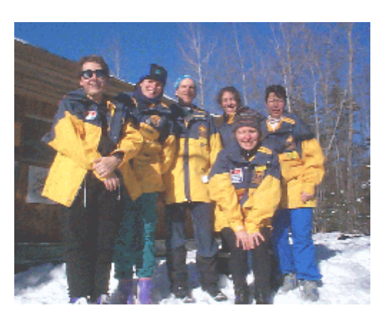
Ski Patrol at the ready.