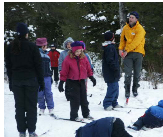
The Jackrabbits' first session - Are these kids learning to fall and get back up or searching for lost jellybeans??

Kawartha Nordic Ski Club Inc. P.O. Box 1371, Peterborough, ON, K9J 7H6 Infoline: 705 749 5605 Web site: www.x-c.com/clubs/kawartha